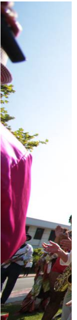
Musicians preview a performance for the Honk! Oz music festival this weekend.

The Honk! Oz music festival will kick off in Wollongong's CBD on Friday.